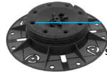
BASE + SCREW 1 9/16"