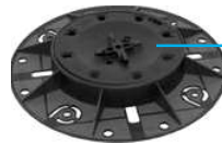
BASE + SCREW 13/16"