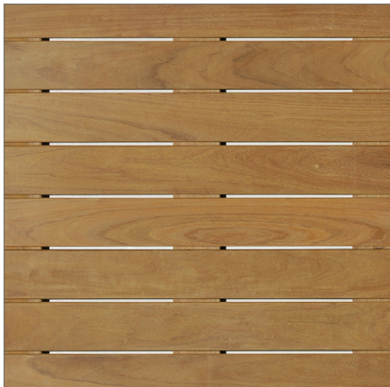
24" Ipe Tile - Smooth Surface