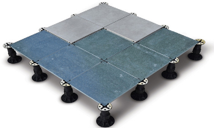
Shock protection tray (no corner plates)

NOTE: While we believe the Archatrak 'Spansafe' tray and hold down screw system will provide a degree of wind uplift mitigation, we have not commissioned any specific wind uplift testing to quantify the additional benefits that this system may provide.