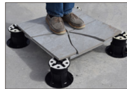
Tray supporting person's weight