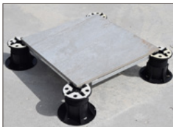
Paver on tray

since the total height of the tray at the corners is only 3/16" max. We recommend placing a rubber shim (e.g. our ETE-LGH2) or a bead of silicone adhesive between the pavers and the plates to minimize noise transmission and/or rattling.