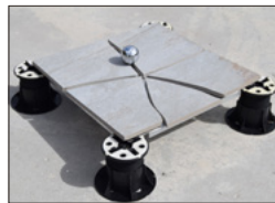
Broken paver supported by tray